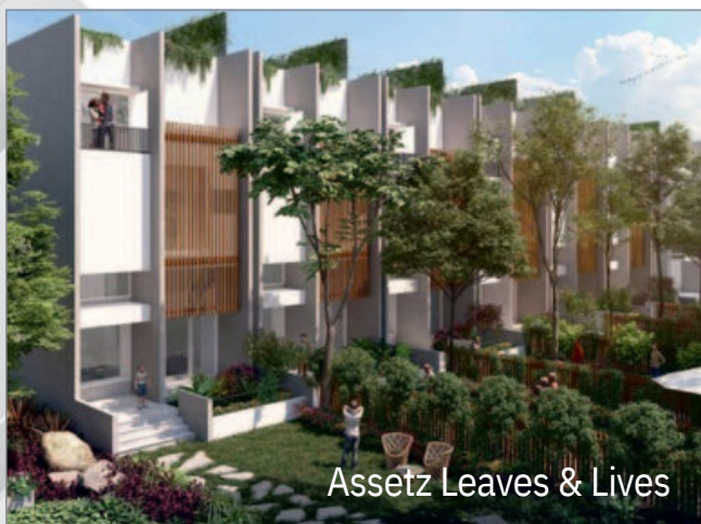
Assetz Leaves & Lives