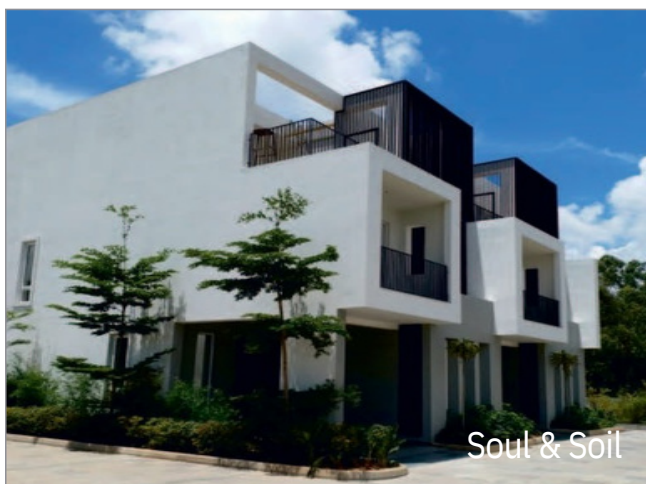
Soul & Soil