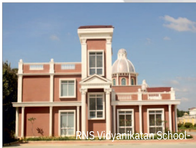
RNS Vidyanikatan School-