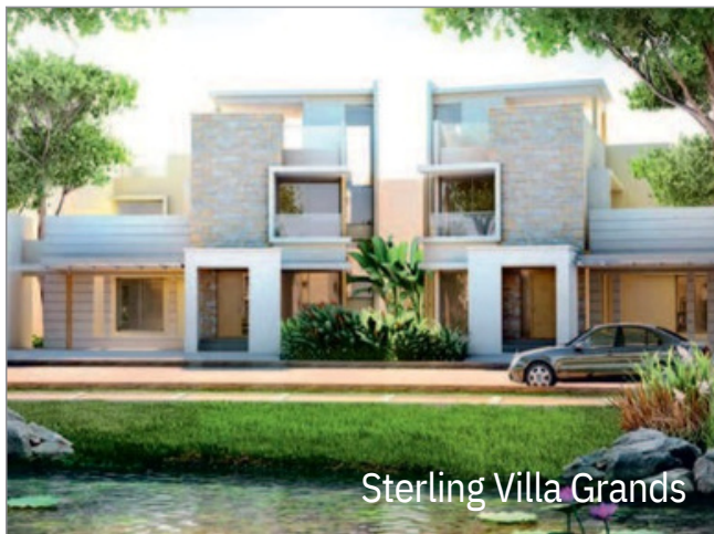
Sterling Villa Grands