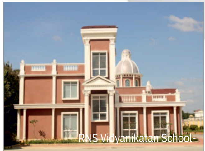
RNS Vidyanikatan School-