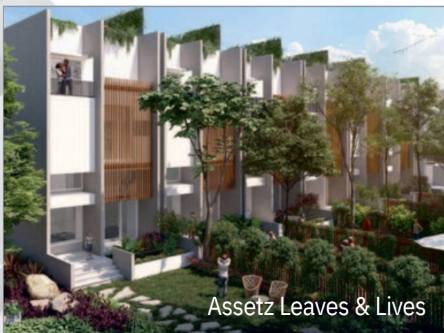
Assetz Leaves & Lives