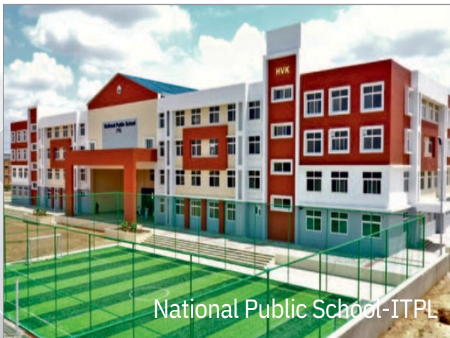
National Public School-ITPL