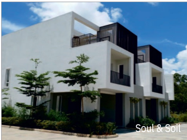
Soul & Soil